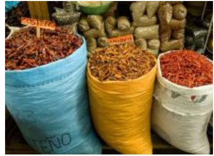
Enjoy the local food