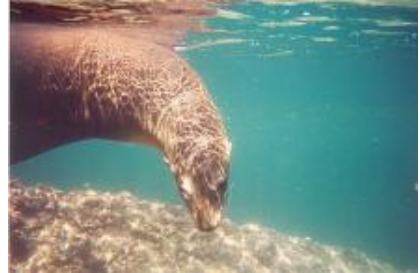
Swimming with sea lions!