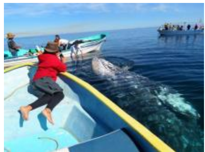
Whales in Mag Bay