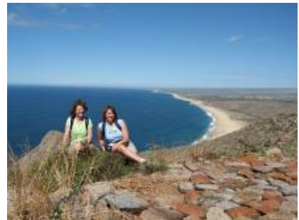
Enjoying a cliff walk