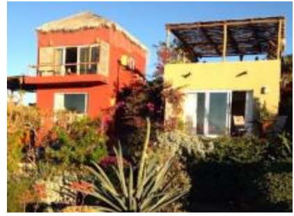
Welcome to your charming casita in Todos Santos