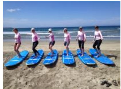
Surfing lessons are fun