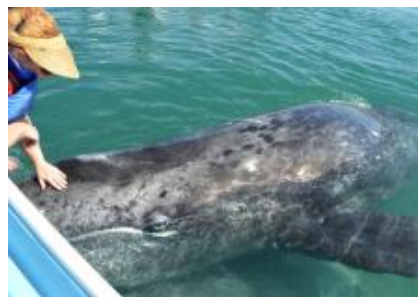
Whales in Magdalena Bay

A peak lifetime experience awaits you today! After being transferred to Magdalena Bay (4 hours), an area of protected lagoons where gray whales come to mate and give birth each year, from late January through mid-March. A motorized skiff will take you deep into the lagoon lagoon where you won't be just a spectator – you may actually be able to pet some of the mother and baby whales that swim right up to the boat to look you in the eye! You'll spend the next two nights at ROW's tent camp on an island at the mouth of the Lopez Mateos lagoon. This remarkable location provides you with the opportunity to be delighted not only by the whales playing just offshore, but by a host of other wildlife including dolphins, sea lions, a vast array of birdlife and more! Comfortable camping allows you to relax and enjoy the scenery while your professional naturalist guides provide you with dinner, drinks, and plenty of great information.