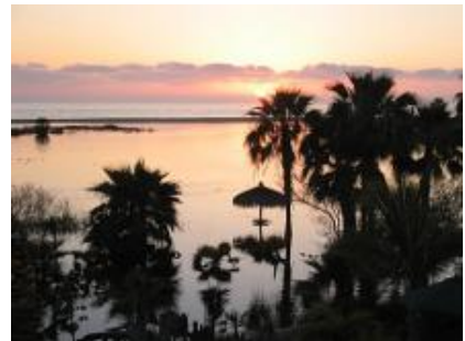
The sun sets on Todos Santos and your journey