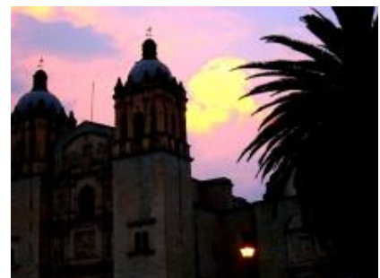
Welcome to Baja!

Welcome to Baja! Upon arrival you'll be met at the airport in San Jose del Cabo and driven to La Paz ( 2 1/2 hrs), where you will check into a lovely hotel. La Paz is the capital of Baja California Sur, built along the shores of the incomparable Sea of Cortez. Once one of the leading pearl diving centers in the world, La Paz is now a mecca for adventurers seeking to explore the incredible bounty of the Sea of Cortez, which is a UNESCO World Heritage site and home to 39% of the world's total number of marine mammal species, a third of the world's marine cetacean species, and 891 fish species.